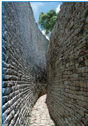
This photograph shows part of the Great Enclosure.